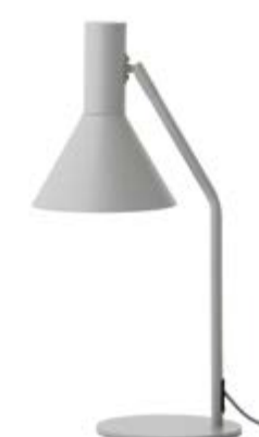
Matt light grey: art.no. 101399