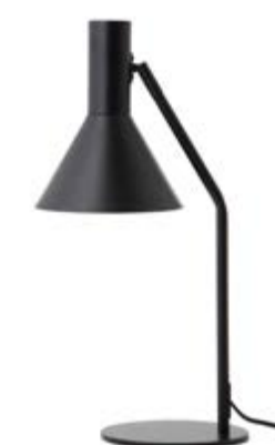
Matt black: art.no. 101401