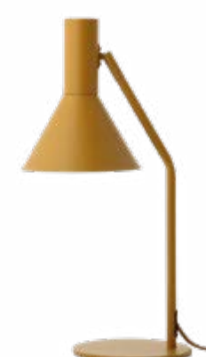
Matt almond: art.no. 101397